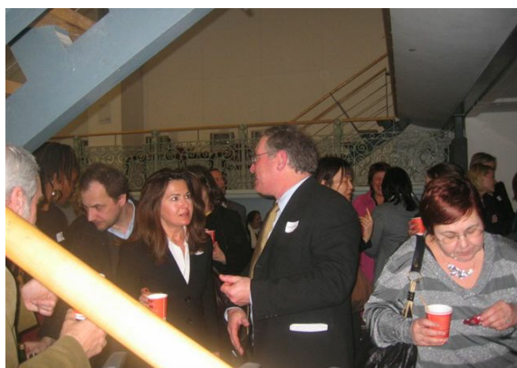
Delegates networking during a break.

Agreeing that PSI can expose interpreters to harrowing situations and images in hospitals and coroners' courts, she referred to the Metropolitan Police's counselling service, which provides useful support to officers, and hoped this would be extended to interpreters via their professional bodies.