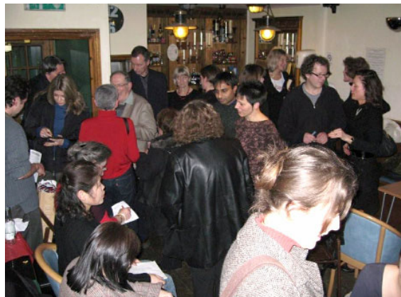
Participants mingling after the event.

status as a mark of quality, enabling them to stand out from the crowd. It could also represent a valuable negotiating tool and a justification to command higher rates. As a marketing tool, the CL after a person’s name would be a distinct advantage.